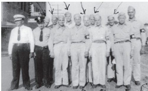
World War II service personnel on Plant Street.

World War II, which began with the Nazi invasion of Poland in September 1939, was fought thousands of miles from American shores. On December 7, 1941, the attack on our base at Pearl Harbor brought our country into what became a global conflict.