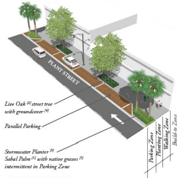
Typical Plant Street Streetscape: On-Street Parking Treatment

REQUIRED DIMENSIONS: Parking Zone: Planter Length: 20' 8' minimum width Planter Spacing: 50' center to center Planting Zone: 6' minimum width Walking Zone: 6' minimum North side 12' minimum South side